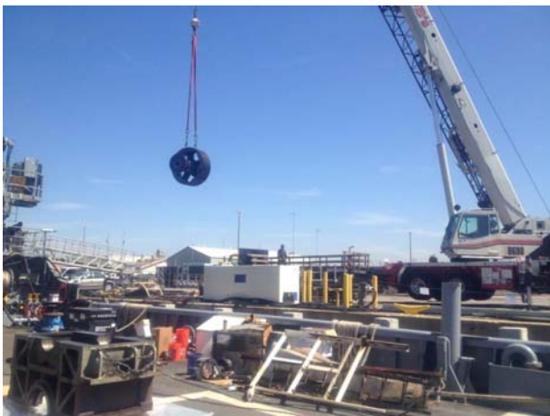
Removing the bull gear assembly from USNS Sioux through a hole cut in the flight deck.