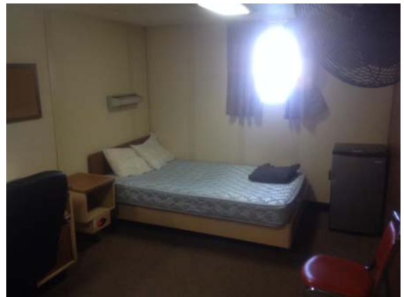
USNS Kaiser Stateroom