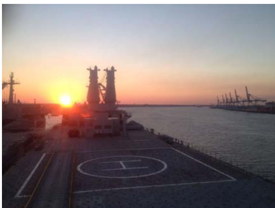
Sunset over the Mississippi River from the aft house looking forward aboard SS Altair

My first ship was the SS Altair (launched 1974 as SS Sea-Land Finance), a former Military Sealift Command (MSC) Roll On – Roll Off (RO-RO) in Marrero, Louisiana. The ship is now owned by MARAD and is in Reduced Operating Status. Altair, along with her sister ships, is among the fastest cargo vessels ever built. I spent much of my time onboard this ship working on the evaporator, which is used to produce the massive amounts of water that the steam plant aboard Altair consumes. She was home to the largest boilers ever installed on a commercial ship. I was on this ship for a month before my orders to an active MSC ship came through.