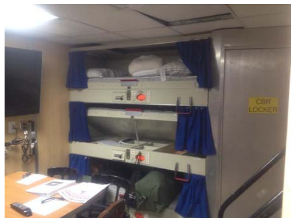
USNS Sioux berthing