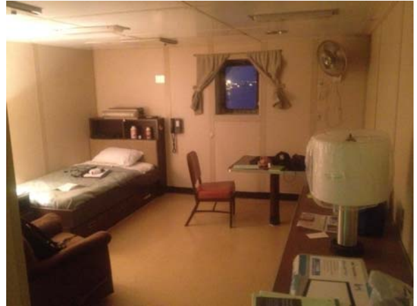
SS Altair Stateroom