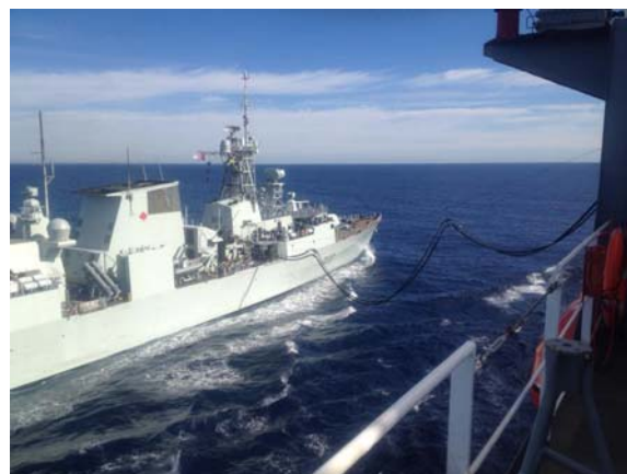
USNS Kaiser refueling a Canadian warship, HMCS Winnipeg

My third and final ship was USNS Sioux (T-ATF 171) (launched 1980), a Powhatan-class oceangoing tugboat also owned and operated by MSC. She was docked at Naval Base San Diego, on 32 nd street in National City, California. I was only underway aboard Sioux for three days for a diving/salvage training operation with a number of Navy divers and Explosive Ordnance Disposal personnel. After this, she entered a Vessel Repair period, during which I assisted with a lot of contractor management issues, as the shipyard workers were constantly cutting corners in their assigned work. I believe this to have been a valuable leadership opportunity.