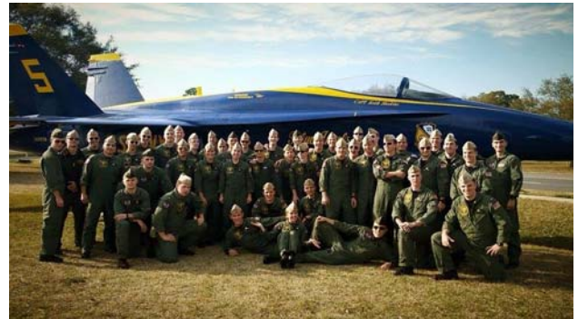
API (Aviation Preflight Indoc.) class