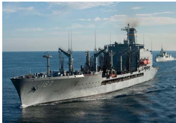
USNS Henry J. Kaiser

the San Diego area. Kaiser was at sea 5 days a week conducting UNREP operations. I spend the vast majority of my time aboard Kaiser chipping paint in the engine room.