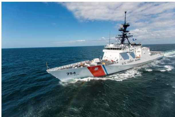
The Joshua James