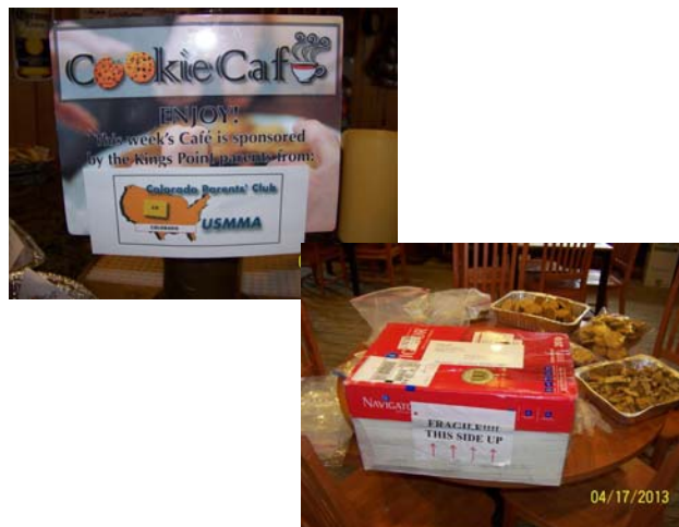
Last April's Colorado sponsored Café.