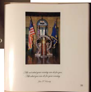
Cover and sample page from Mary Jane's book.

Another great Christmas present could be a copy of the Cookie Café Cookbook . Details about this can be found at http://kpcookiecafe.com/ . The book is a compilation of recipes from parents, friends and alumni and contains lots of pictures of happy midshipmen stuffing their faces of the baked goodies. The book sells for $20 plus shipping and can be ordered at midshipmanmorale@gmail.com .