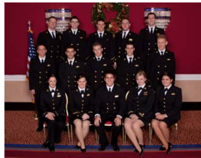
2012 CASAB. USMMA students from Colorado. Please check it out for more inspirational pictures and information.

With our Midshipmen dressed in their finest, the Ball consists of a formal dinner, dancing, professional portraits in spectacular surroundings at the famous Broadmoor Hotel in Colorado Springs.