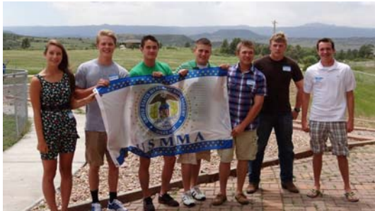
Class of 2018 present at the Welcome Picnic July 2014