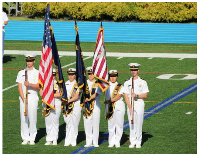
USMMA Color Guard. Picture borrowed from the USMMA website.

The Battle Standard is displayed in Wiley Hall. All midshipmen must come to attention and salute the flag upon entry and exit.