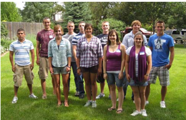
Colorado contingent to Class of 2014 at the Welcome Aboard picnic June, 2010