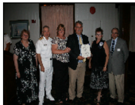
Indiana, Kentucky, Tennessee Chapter