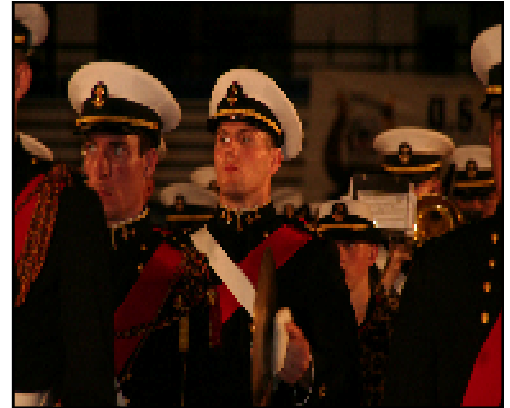
Percussionists at Beat Retreat.