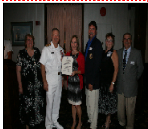
South Virginia Chapter