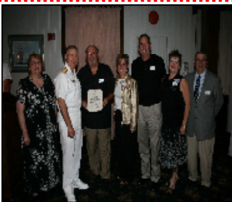
South Texas Chapter

If you are currently a state president, a newly elected state president, or an RVP, please forward updated contact information, including your phone and e-mail, to rmjuschetto@yahoo.com before December 10th. Be sure and include your address, phone numbers, e-mail addresses, and the beginning and ending dates of the term of office, your officer title and the names and graduation years of your midshipmen. Thanks for helping keep our data accurate.