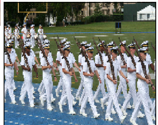
At right, new plebes march in review.