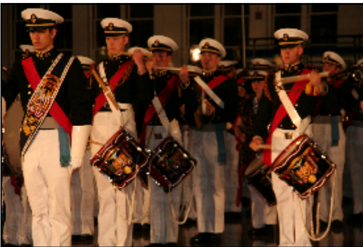
The drum line shows their skills.