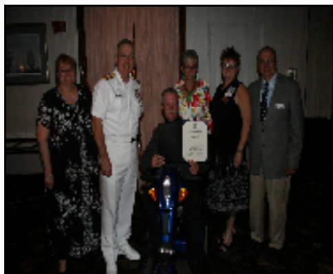
Lake Michigan Chapter