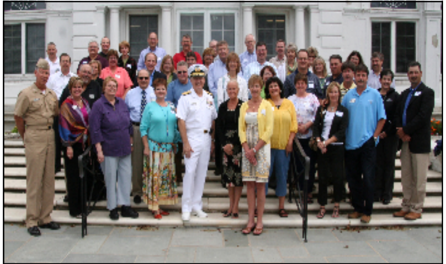
Members attending the USMMA Parent Association Annual President's Conference pose for an official portrait with Academy Administrators in front of Wiley Hall, Sept. 10, 2009.