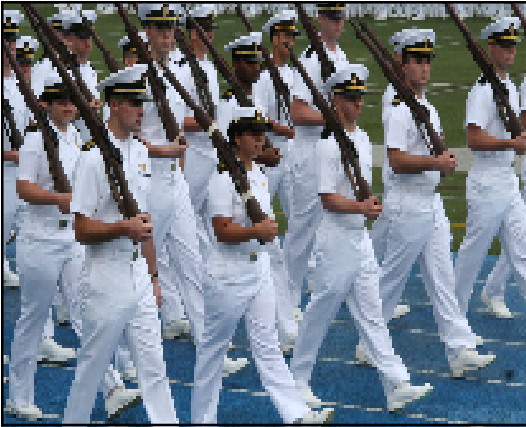
New Plebes pass the reviewing stand.