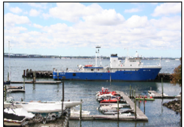
At right, the Kings Pointer is docked.