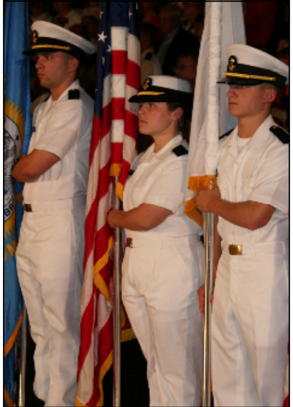
Part of the "Star Spangled Banner Brigade" line up at Beat Retreat.