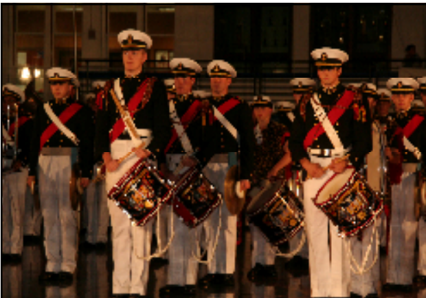
At left, the USMMA Regimental Band keeps the rhythm during Beat Retreat.