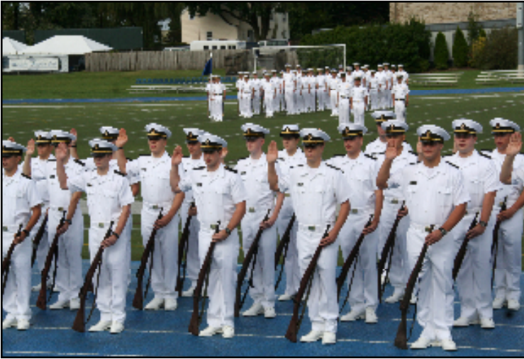
New plebes taking the oath of acceptance into the regiment.