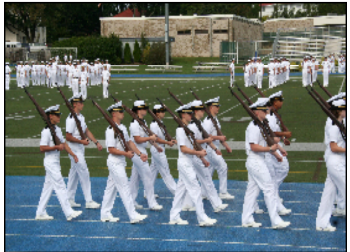
New Plebes march to join the regiment at Acceptance Day.