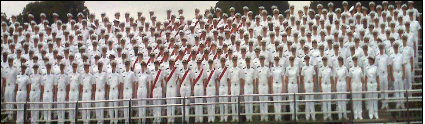
The rain stopped just long enough for the formal 2013 class photo to be taken in the stands of the football stadium.