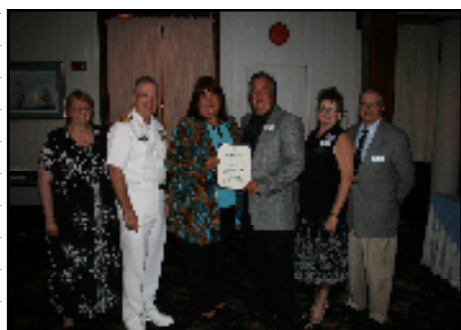
N. California/Nevada Chapter