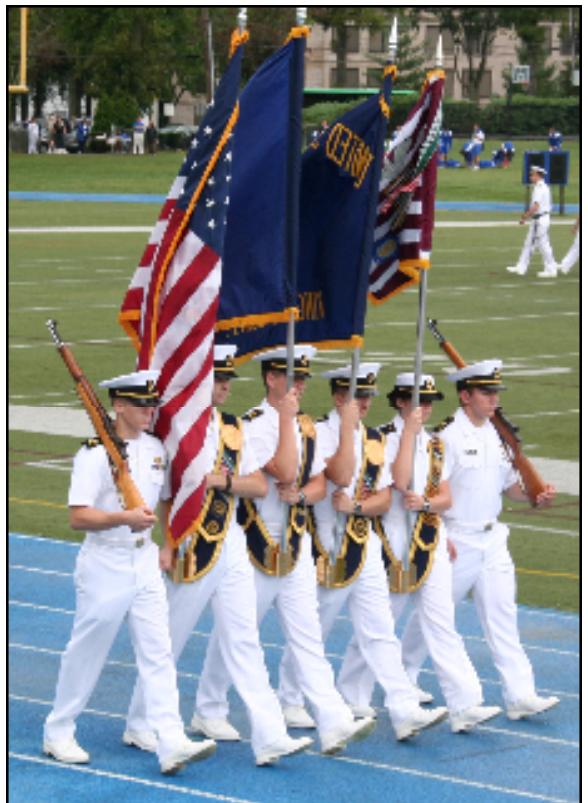
The Color Guard on Acceptance Day.