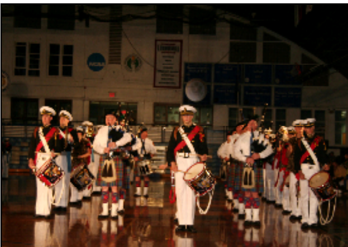
On Friday night, September 11, the USMMA Regimental Band performed the traditional Beat Retreat with the Nassau County Police Pipe and Drum Corp, to a full house in O'Hara Hall.