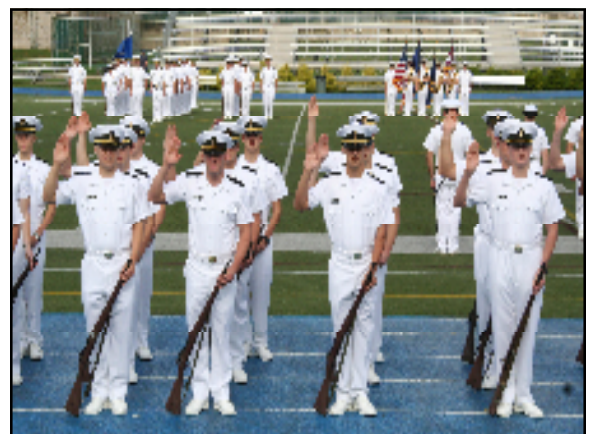
At right, plebes take the oath during Acceptance Day.