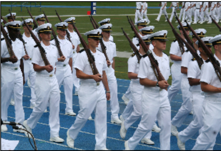
New eagles will soon be on these uniforms!