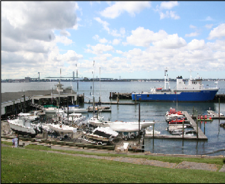
Dock panorama on September 11, 2009.