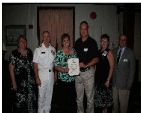
North Carolina Chapter