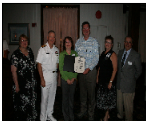
North Texas Chapter