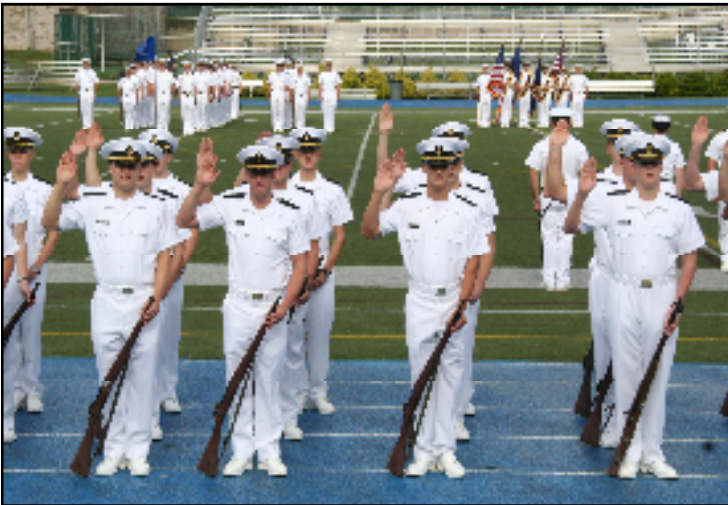
Candidates no more! Plebes take the oath that makes them part of the USMMA Regiment.