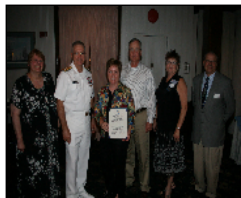
Northeast Ohio Chapter