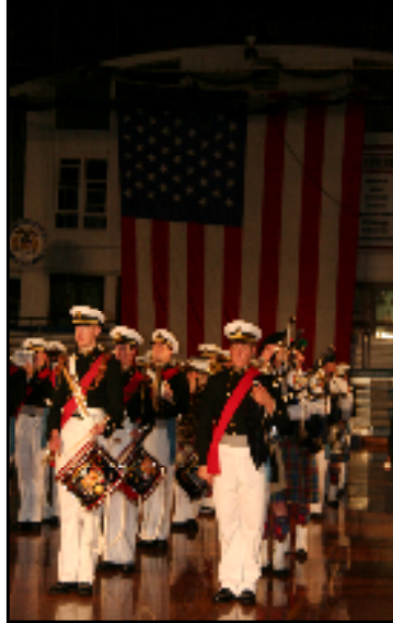
Above, the flag is unfurled at Beat Retreat.