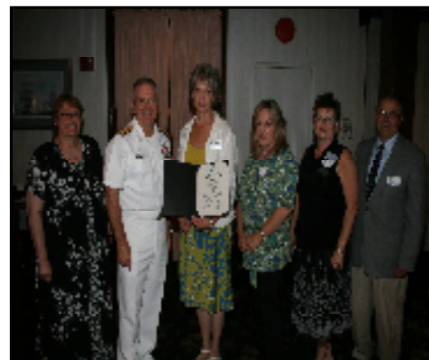
New York Chapter